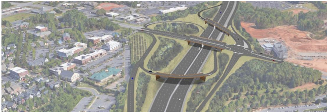
SC 160 at I-77 Improvements Rendering

State officials broke ground on improvements to SC 160 at I-77 in March. This interchange will be reconfigured with the first-of-its-kind-in-South-Carolina offset direction interchange which will reduce left-turn conflicts. The reconstructed interchange is scheduled to be open to the public in late calendar year 2027.