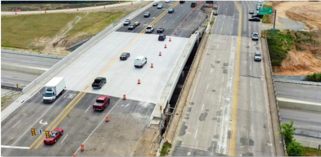
US 1 at I-20 bridge opening

To wrap up the fiscal year, the agency opened the third northbound lane on I-85 from mile marker 80 to mile marker 90 as part of the interstate's widening and improvement project.