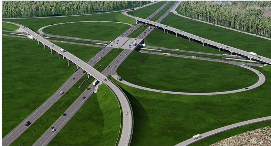
Rendering of I-26/I-95 Interchange Improvements

During SFY24, the agency broke ground on improvements forthcoming to the I-26/I-95 interchange in Orangeburg County. The project will reconstruct this major existing system interchange and provide for acceleration and deceleration lane tie-ins that will increase efficiency and reduce delays.