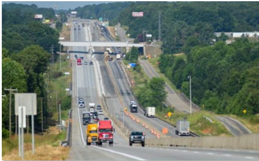
I-85 northbound lane opening

To wrap up the fiscal year, the agency opened the third northbound lane on I-85 from mile marker 80 to mile marker 90 as part of the interstate's widening and improvement project.